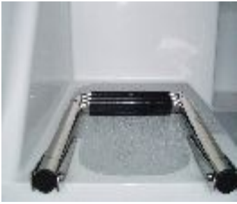
Stainless Steel Folding Ladder