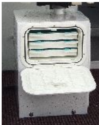
Fishing Tackle Trays