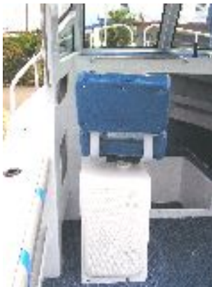
Passenger Seat Box & Seat