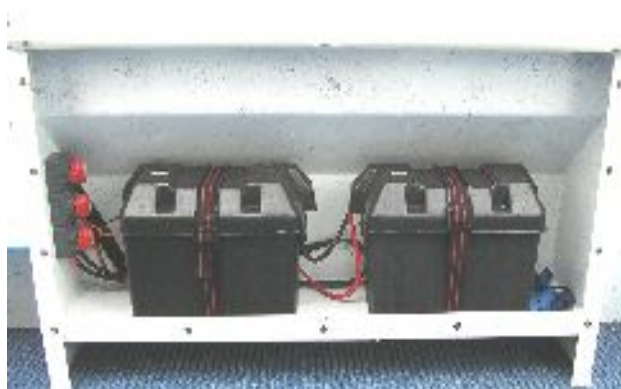
Battery Boxes, Battery Shelf & Isolator Switch