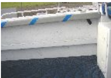
Padded Knee Rails