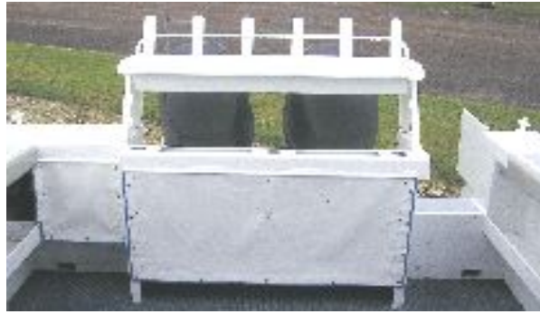
Deluxe Bait Board/ Bait Tray Under / 6 Rod Holders.