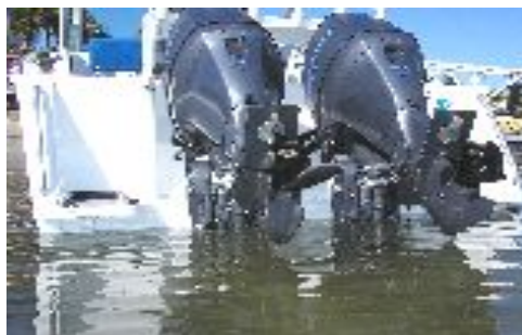
Twin Yamaha Engines