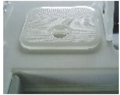
Live Bait Tank Plumbed