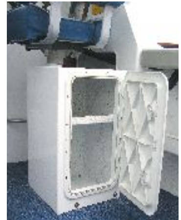
Seat Box Hatch & Shelf